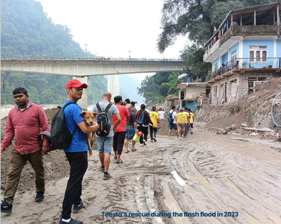
Teesta's rescue during the flash flood in 2023

A dog rescued from Teesta has thrived at our shelter and has made it her permanent home. Returning to Teesta, which is currently threatened by monsoon rains and river rage, was not a viable option. A community caretaker who visited the shelter was relieved to see her safe and thriving at KAS. We extend our heartfelt thanks to Help Animals India for supporting the KAS team with relief operations in 2023, enabling us to save this loving and friendly dog, now affectionately named the river - Teesta.