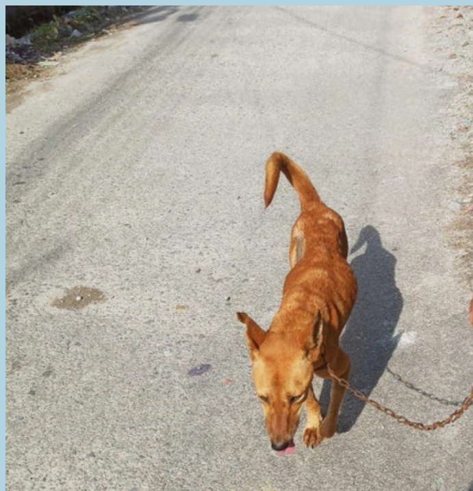
Upon her arrival in Siliguri