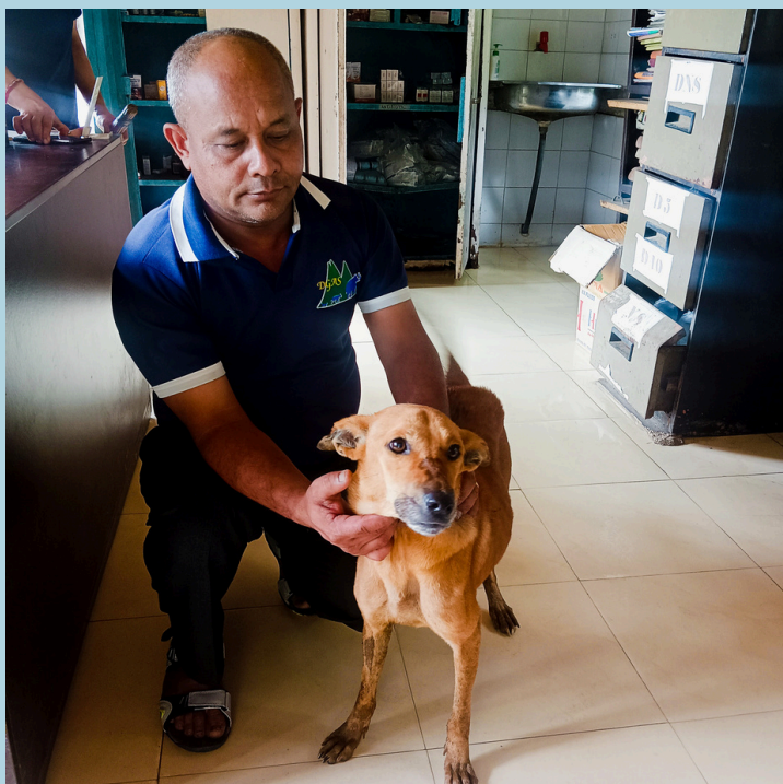
Before her departure at KAS

A dog from Siliguri with TVT was admitted to our shelter for a month for chemotherapy treatment. We are pleased to report that the dog made a swift recovery and was spayed before being released back to Siliguri, ensuring she no longer has to suffer.