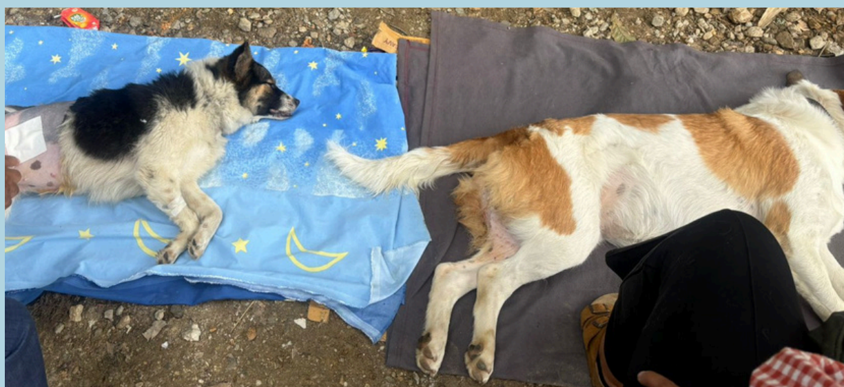
Dogs are allowed to rest at the Village camp until they have fully regained their consciousness following the surgery

In 2023, the invaluable support from Help Animals India enabled us to sterilize over four hundred dogs across various blocs of Kalimpong. This year, our sterilization camp has just commenced, and we are hopeful to receive the continued support of Help Animals India to further our efforts in controlling the stray dog population.