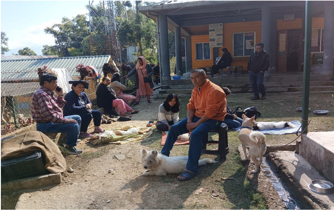
Owners wait along with their pet animals outside the OT at KAS for the ABC operations

The team successfully carried out ABCs, including sterilisations for felines, in December at the Shelter and twenty-two dogs and two feline companions at the Village camps in Gorubathan. Ongoing ABC Programmes showcase the team's commitment to community animal well-being. These programmes are vital for reaching out to animals and the community, contributing to their overall welfare.