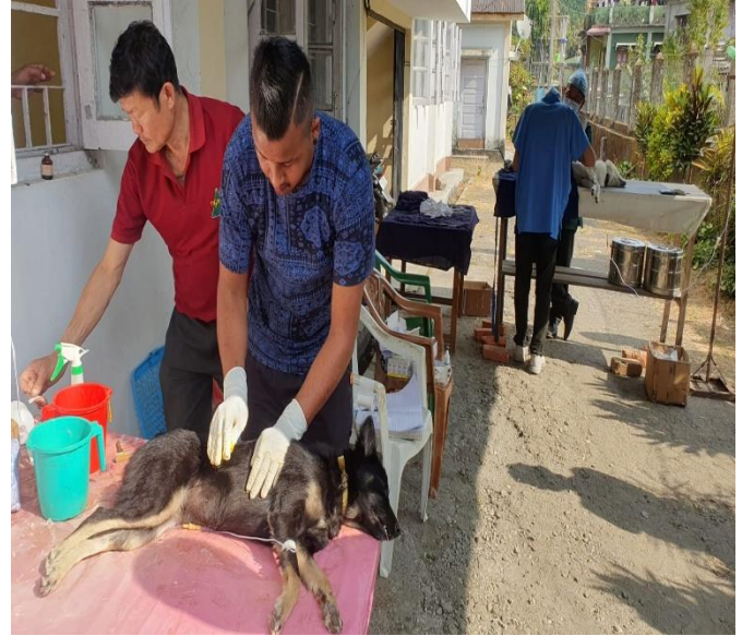
At the Village Animal Birth Control camp in Gorubathan, Kalimpong

Fig. below shows the Veterinary report for the month of December