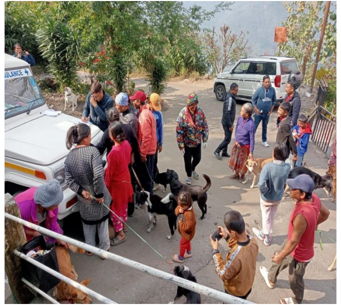
Anti-rabies drive at Bhalukhop and adjacent areas in Kalimpong