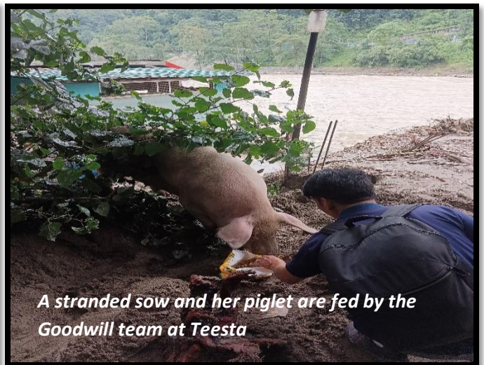
A stranded sow and her piglet are fed by the Goodwill team at Teesta

The Shelter team witnessed the suffering of farmed pigs that were washed away from their sty and brought to the shore at Teesta, Kalimpong. The sow and her piglet that were displaced were starving for hours. The Shelter team was able to provide them food and relieve their pain by requesting locals to help them rehabilitate. Dogs with minor injuries were treated by the Shelter team on the spot, and both owned and community dogs were vaccinated against rabies in all the affected areas ensuring their safety along with the safety of the community.