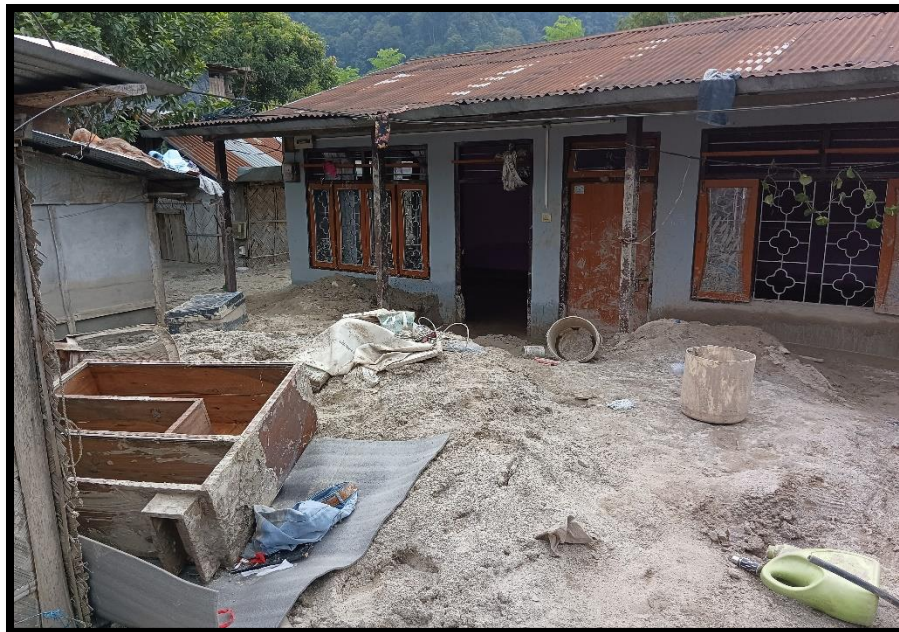
In Pic – A house at Rongpo that caved in and submerged in debris