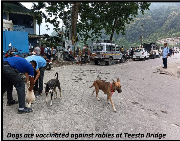
Dogs are vaccinated against rabies at Teesta Bridge