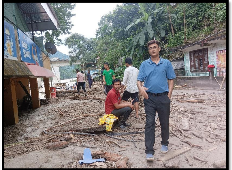
The settlement at Teesta was ravaged by flash floods