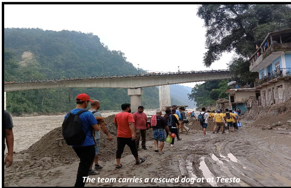
The team carries a rescued dog at at Teesta

A troubled and distressed dog in season was rescued by the team as well and brought to KAS where she will undergo sterilisation once she is at ease.