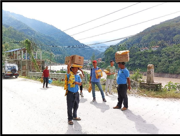
The KAS team carrying kibble for dogs at Bhalukhola