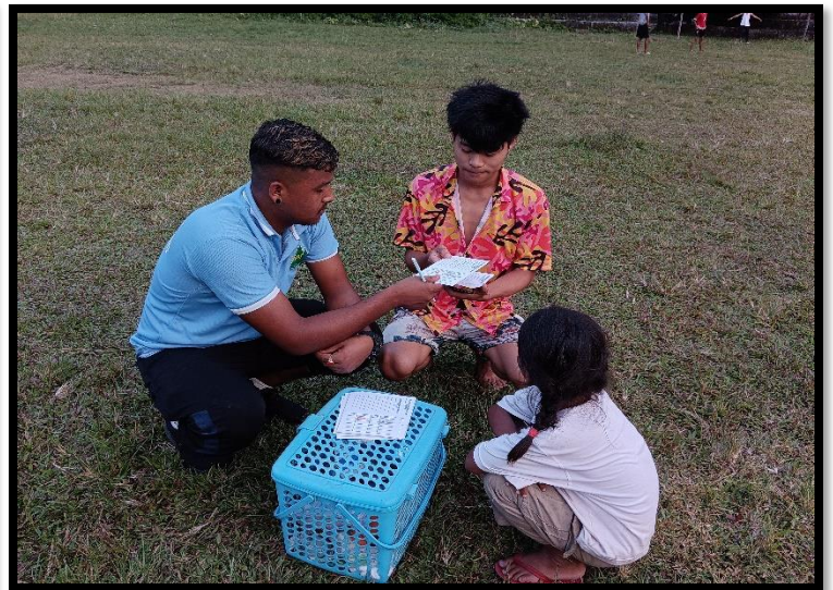
Vaccination certificate is handed out to an owner