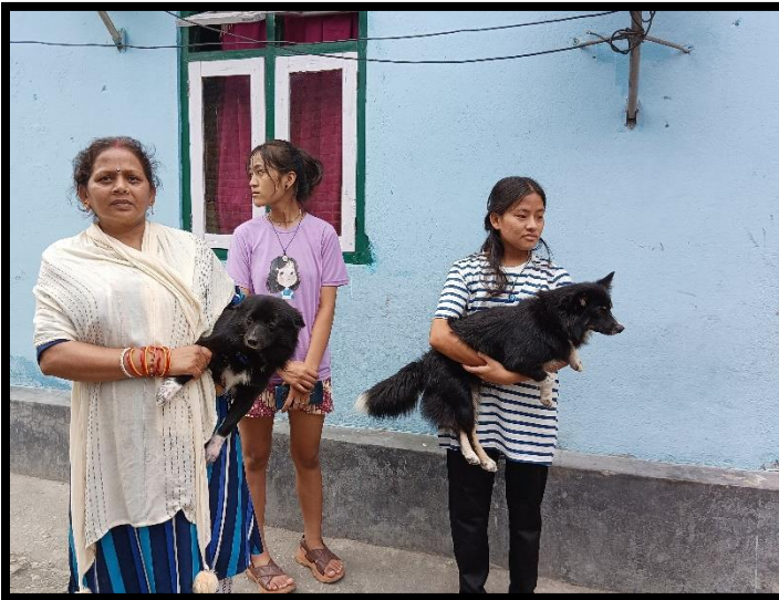
Owners' dogs come for vaccination at Rongpo