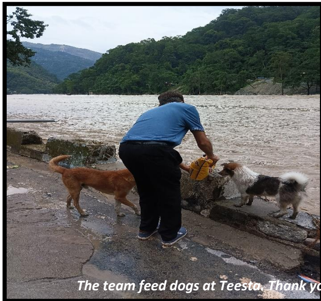
The team feed dogs at Teesta. Thank you Pedigree India for the food donation

The team inspected dogs that were vulnerable, and those that suffered trauma in the aftermath of the flood. A lactating dog along with her puppies that were temporarily sheltered by a community feeder at Teesta were rescued and brought to the Shelter by the Goodwill team.