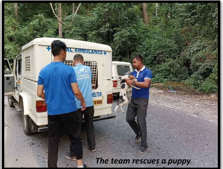
The team rescues a puppy