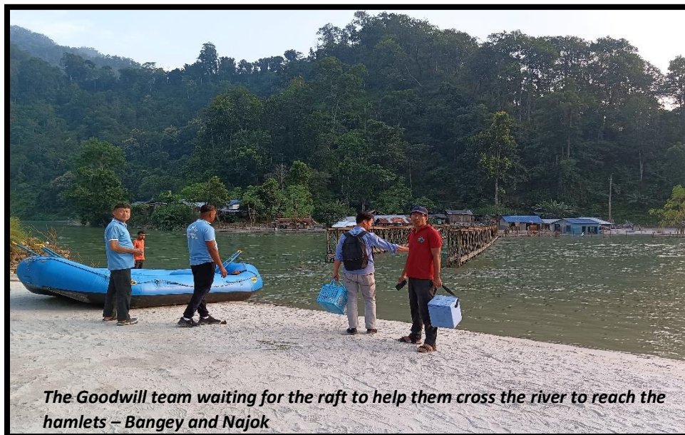
The Goodwill team waiting for the raft to help them cross the river to reach the hamlets – Bangey and Najok

The Shelter team witnessed the suffering of farmed pigs that were washed away from their sty and brought to the shore at Teesta, Kalimpong. The sow and her piglet that were displaced were starving for hours. The Shelter team was able to provide them food and relieve their pain by requesting locals to help them rehabilitate. Dogs with minor injuries were treated by the Shelter team on the spot, and both owned and community dogs were vaccinated against rabies in all the affected areas ensuring their safety along with the safety of the community.