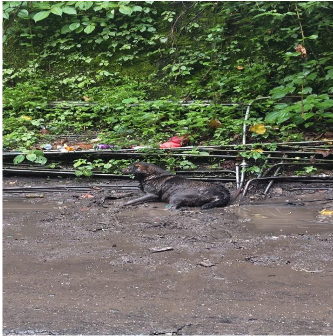
A photo of the sick dog stuck in filth. The DAS team went to his immediate rescue