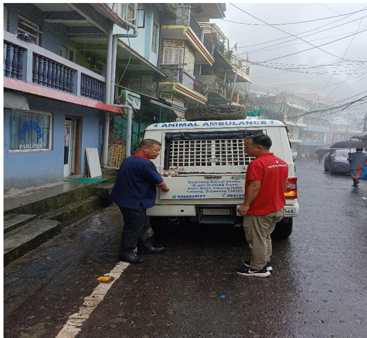
In Pic - The team is ready to release spayed dogs back into their territory