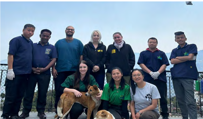
DAS staff with Dogs Trust Worldwide members.