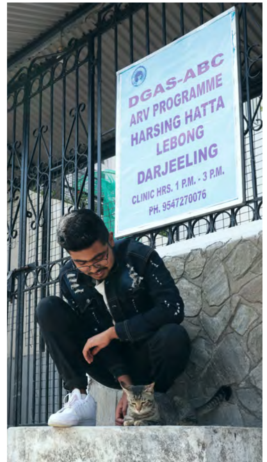
A young man meets a resident.

DGAS-ABC ARV PROGRAMME HARSING HATTA LEBONG DARJEELING CLINIC HRS. 1 P.M. - 3 P.M. PH. 9547270076