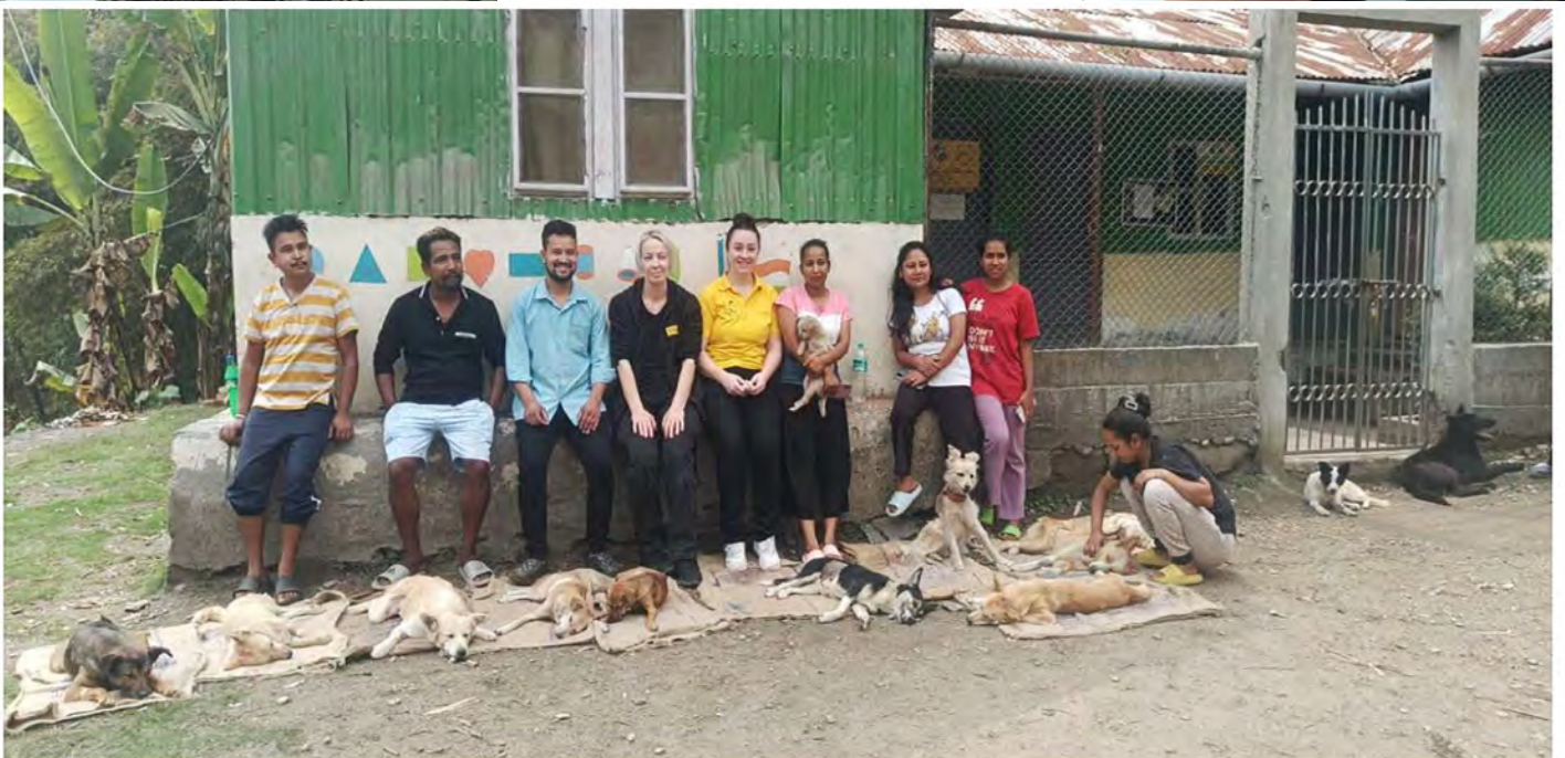
Dogs waiting for their recovery with the DTW members at Badamtam Tea Estate