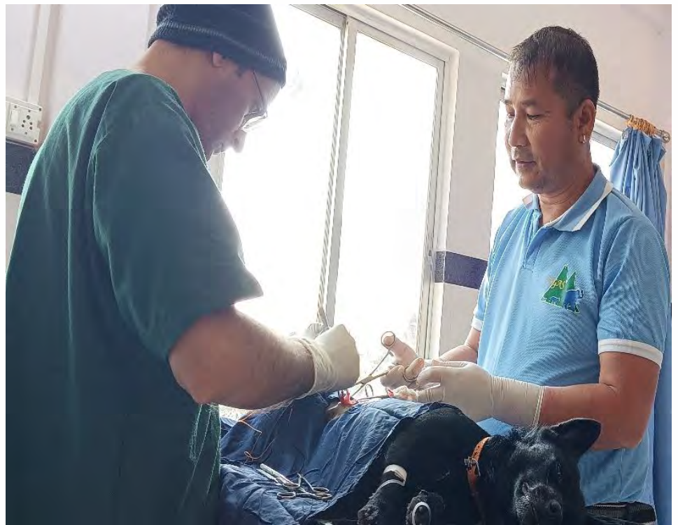
An elderly couple waiting for their dog to be spayed & the procedure underway. It was a success!