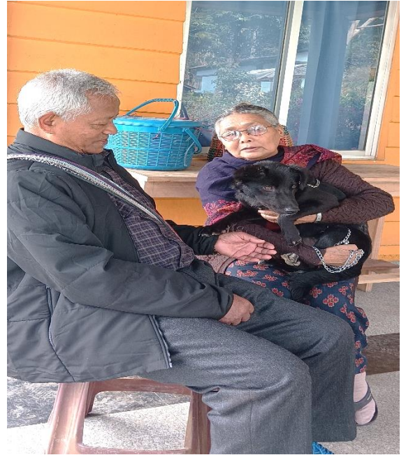
An elderly couple wait for spaying their dog at KAS

Lots of puppies have come as rescues to the Shelter and we have been searching for a loving home for them. A few of them have already been adopted.