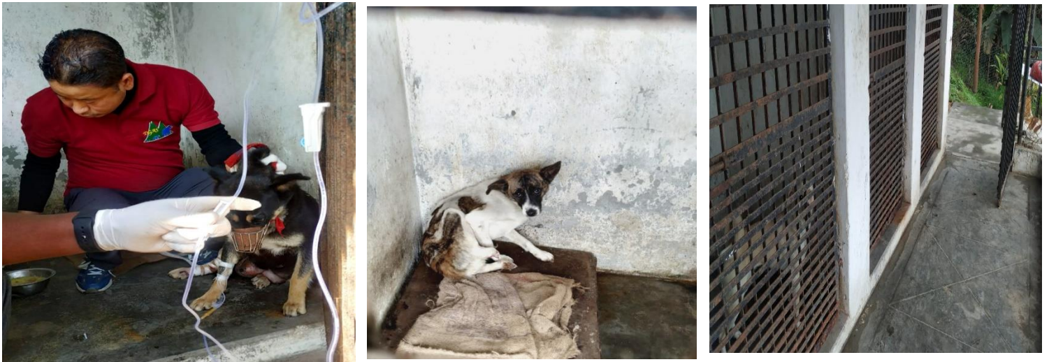
Pic 1. Rescues undergoing treatment in the kennel at DAS

The DAS team currently has rescued over five dogs and have released the older ones that have got their treatment done and have fully recovered.