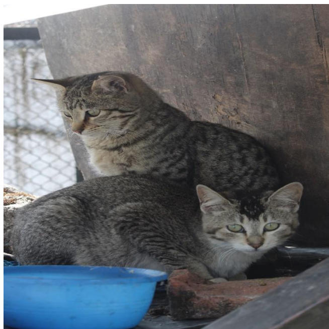
Some of the rescued animals. DAS is their home now