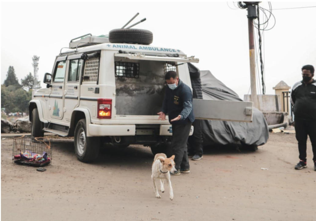
The DAS team releasing a dog after getting her spayed

Daily rescue calls, emergencies and catching of dogs' ward vaccinations keep the Darjeeling Animal Shelter team engaged. The DGAS team has been performing the Animal Birth Control Prg. on dogs funded by Dogs Trust Worldwide. Early in the morning, the team leaves for catching new street dogs that have been located by them. They have been fully focused on spaying and neutering street dogs from Darjeeling thus, reaching the monthly target of ABC on 80 dogs.