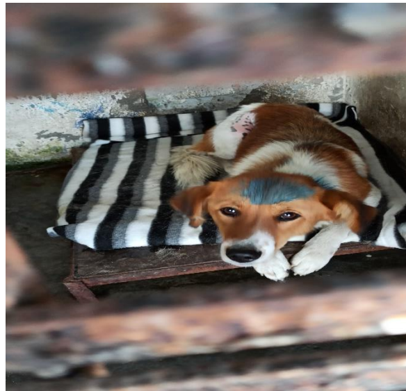
New dog with the blue colour patch on her forehead admitted at the Shelter for a day after she's spayed, the blue mark shows that she's vaccinated.