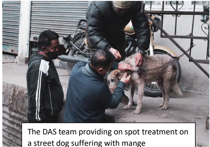
The DAS team providing on spot treatment on a street dog suffering with mange

Some of the old sheltered dogs, Cricket and Digvy have died recently because of geriatric issues. The Shelter has fewer other dogs now that are doing fine and enjoying their days. These dogs are so friendly and love greeting people at the door. All are healthy looking, both cats and dogs.