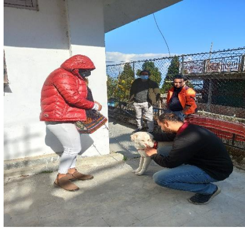
Cases at the Shelter Clinic

Besides, Darjeeling Animal Shelter also has been attending to calls for rescues. Almost every day, there is a rescue call from Teas estates or nearby town areas. The Shelter's kennels are full of rescues and admit dogs for their ABC. Dogs coming for their ABC after they are spayed are kept for a day and checked before releasing to their original place.