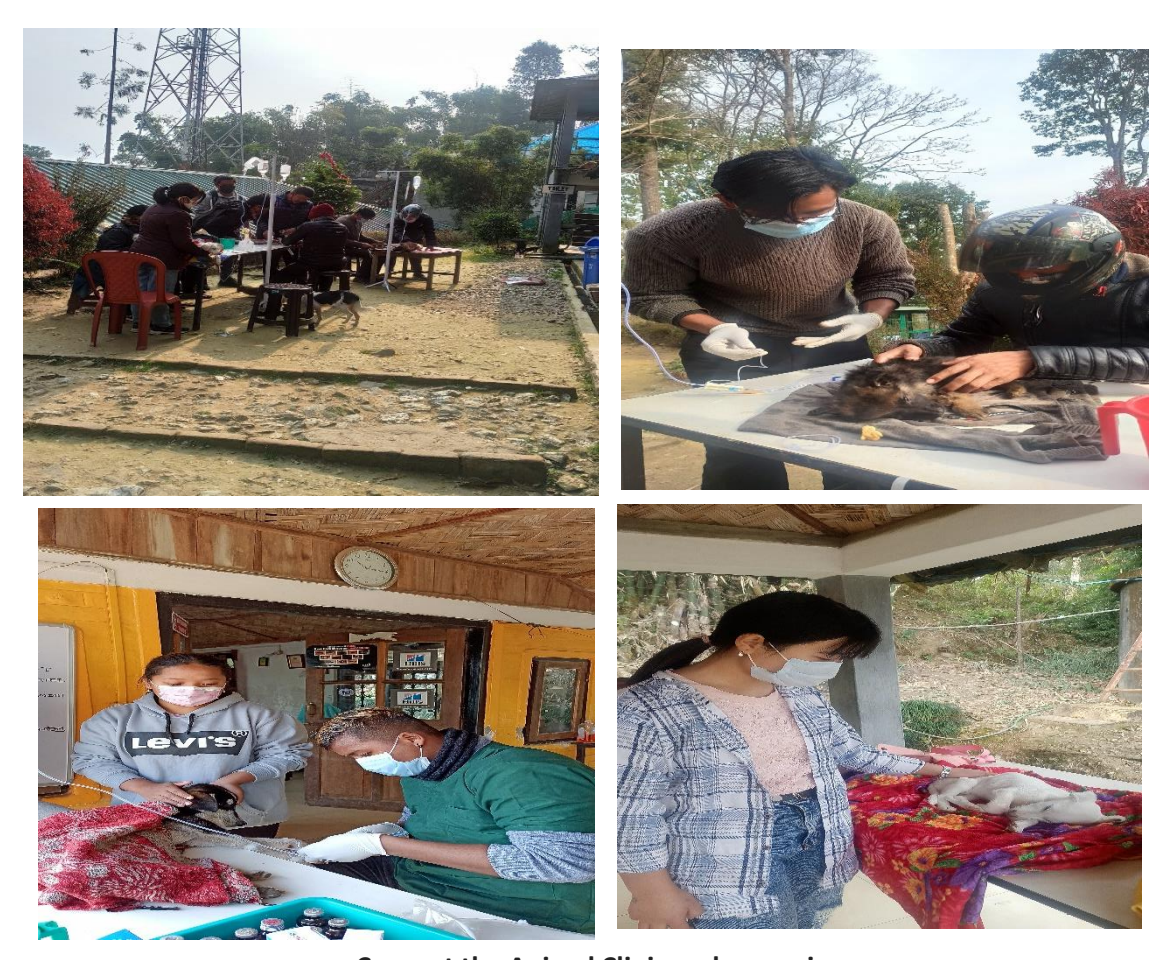
Cases at the Animal Clinic early morning

engaged. There have been several recoveries of these dogs after receiving treatment from the team but also there are a few deaths in them.