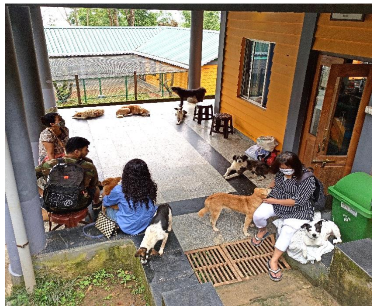
Owners waiting in front of the KAS OT on Animal Birth Control Day