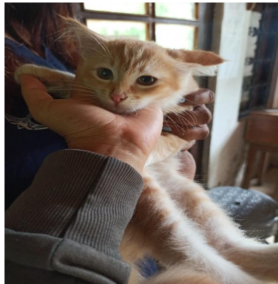
Meet Kuchi, an adopted kitten from KAS. She looks so well taken care of. She came to KAS yesterday for her vaccination. The kitten was adopted by this kind lady when she was very small. She was dumped at the Shelter along with her mother then, lucky she found such a loving adopter soon enough.