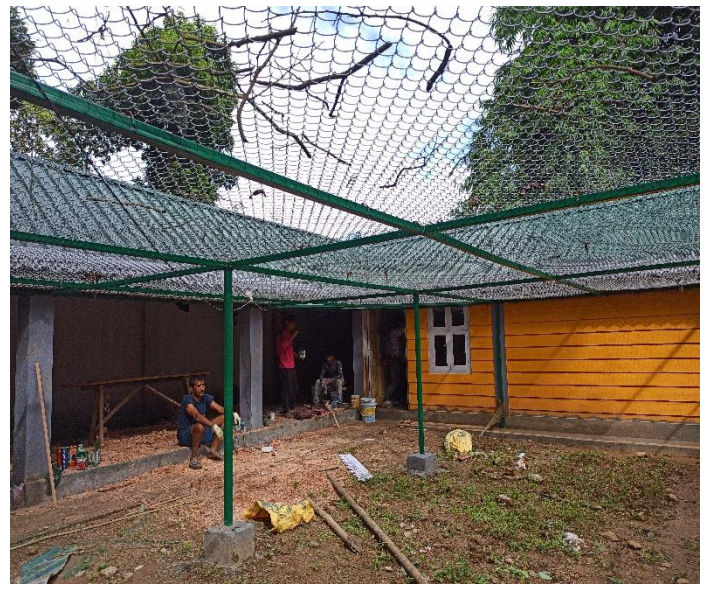
New Cattery – Work in progress