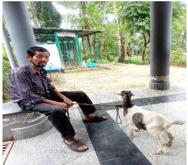
Sick kittens and a goat for treatment at KAS