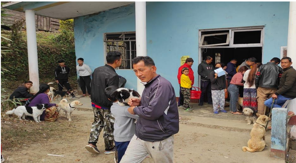
Owners queuing up at camp for getting their pet animals sterilised and vaccinated