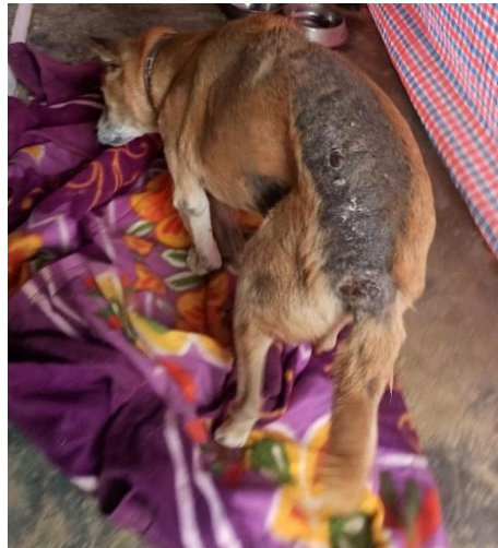
This poor boy was rescued a week ago who is now admitted to KAS. Currently, he is on treatment against mange.