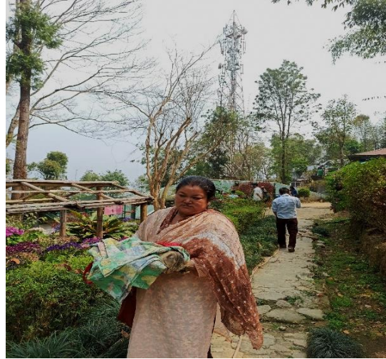
This is the cat brought for spaying by her owner at KAS. After spaying the owner is taking her home