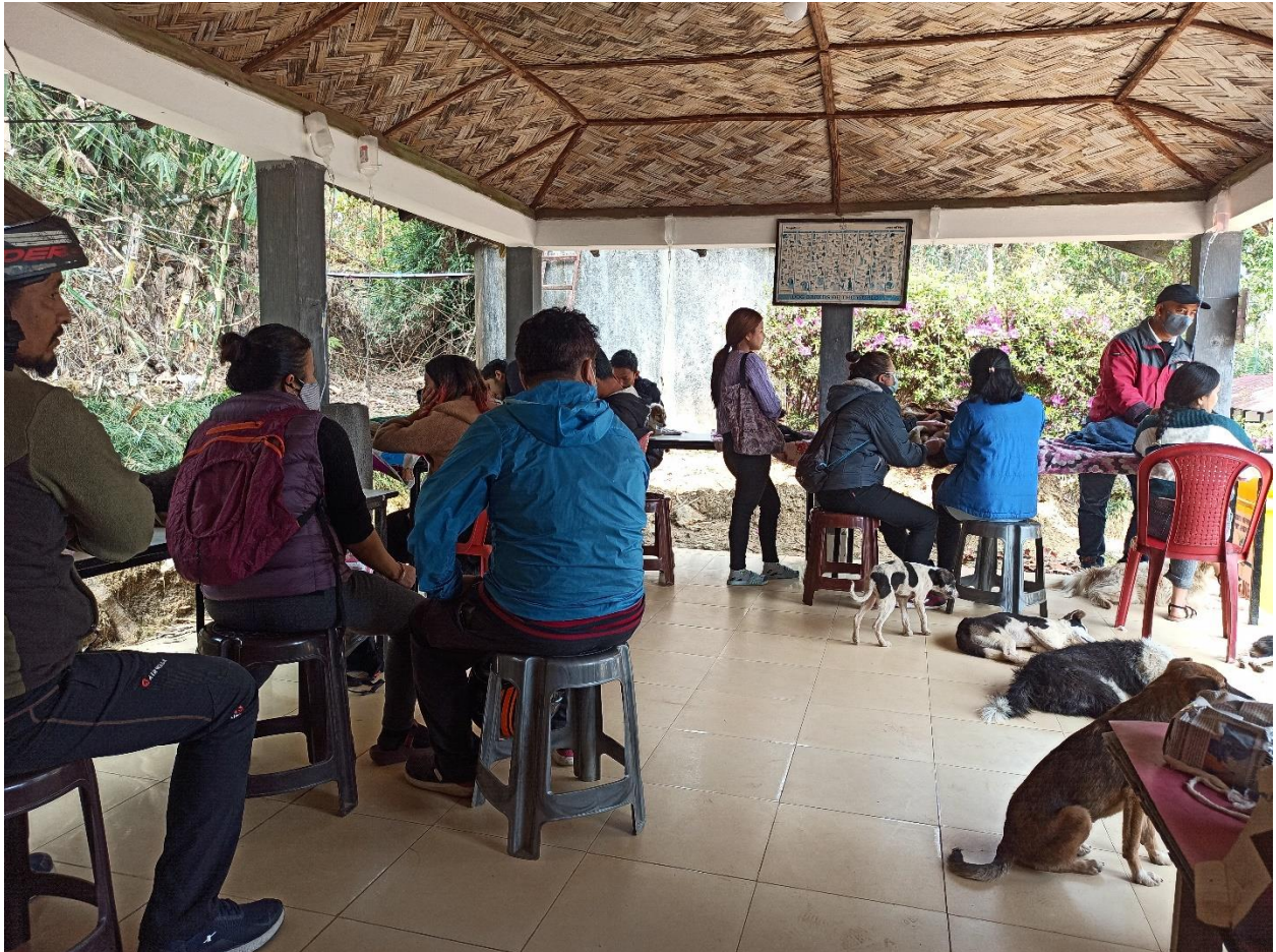
Ongoing treatment at the KAS Clinic. These are sick dogs with parvovirus