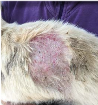
Another case of scalding, rescued by KAS, healed, spayed, and vaccinated, then released again in the spot where she was caught.

The dogs (above) had a bad time when people threw boiling water over them, tired of them lurking around their houses. The shelter, upon receiving a phone call from a member of the public, collected these dogs and was able to treat them.. Both KAS and DAS are able to treat these dogs and, after a full recovery, they can be spayed, vaccinated and returned to the street.