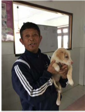
Healthy animals are adopted from DAS