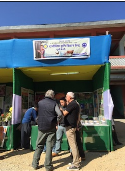
The many tent displays encouraged the best agricultural practices in this remote area of the Eastern Himalayan foothills

The detrimental aspect is that almost all vets go into government practice as soon as they graduate. NGO's find it difficult to compete because the salaries and side benefits are so beneficial for government vets. Fortunately at KAS and DAS we have a very senior and skilled vet who also has a private practice in town, thus supplementing his income.