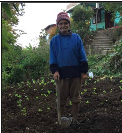
The people who live in the foothills of the Eastern Himalayas often struggle to make a living. The photo on the right shows a woman who has threshed the rice from her fields and is feeding some to her hens. Left: Villagers frequently grow their own vegetables.