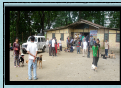
THERE ARE ALWAYS SO MANY ANIMALS IN NEED OF TREATMENT THAT IT IS A LONG DAY AND HARD WORK FOR THE VET AND STAFF OF KAS