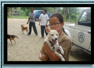
PET OWNERS WITH THEIR ANIMALS WAITING FOR ANTI-RABIES VACCINATION AT NAINAKUMARI SCHOOL IN JULY 2011