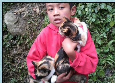
AT THIS CAMP 26 DOGS AND THREE CATS WERE SPAYED, 145 DOGS, 4 CATS AND ONE HORSE WERE VACCINATED AGAINST RABIES