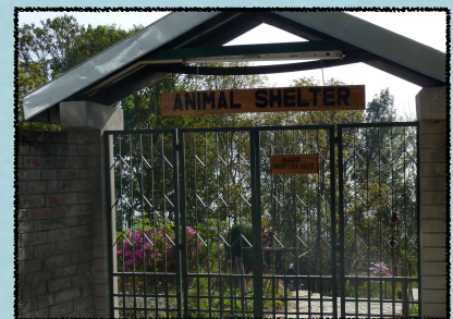
ENTRANCE GATE TO KALIMPONG ANIMAL SHELTER. THE POT-HOLED ROAD ALONG THE RIDGE ENDS AT THIS POINT.