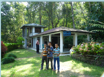
THE DISPENSARY AT KALIMPONG ANIMAL SHELTER WITH GUEST ROOM FOR VOLUNTEERS BEHIND

which leads to a second gate, inside which lots of dogs wait to greet visitors. I wish you could see the shelter – the clinic, kitchen, operating theatre, kennels, dog runs, cattery, two volunteer huts, and vet's house are all attractive, local-style, white-washed free-standing huts or buildings set in two acres of garden. I do believe the gardens help in the rapid healing of animals.