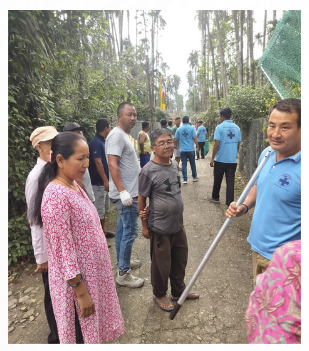
ARV camp at Gorubathan