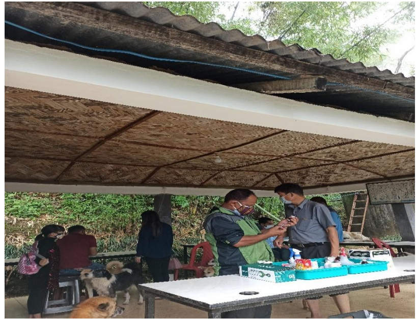
The KAS Clinic – The team at work