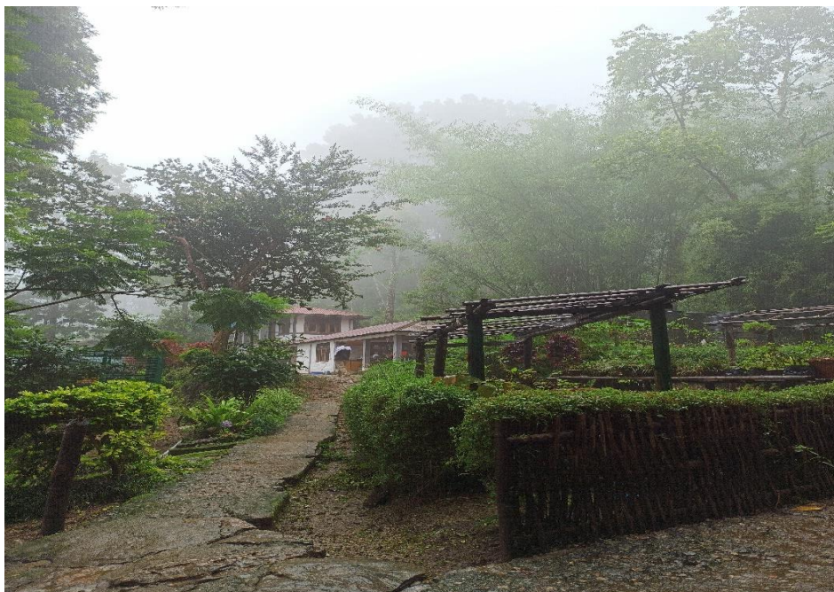
The monsoon rain lashes in at KAS – misty day

The Programmes of Kalimpong Animal Shelter (KAS) continue. We are always ready to help and serve the needy animals, whether rain or shine. Although the monsoon rain has been lashing in, there are patients visiting KAS every day either for their health check-up, blood work, X-rays or veterinary treatment.