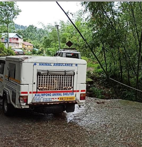
Pictures atop show – The dogs are brought to KAS, spayed, admitted and returned by the KAS Team via KAS ambulance