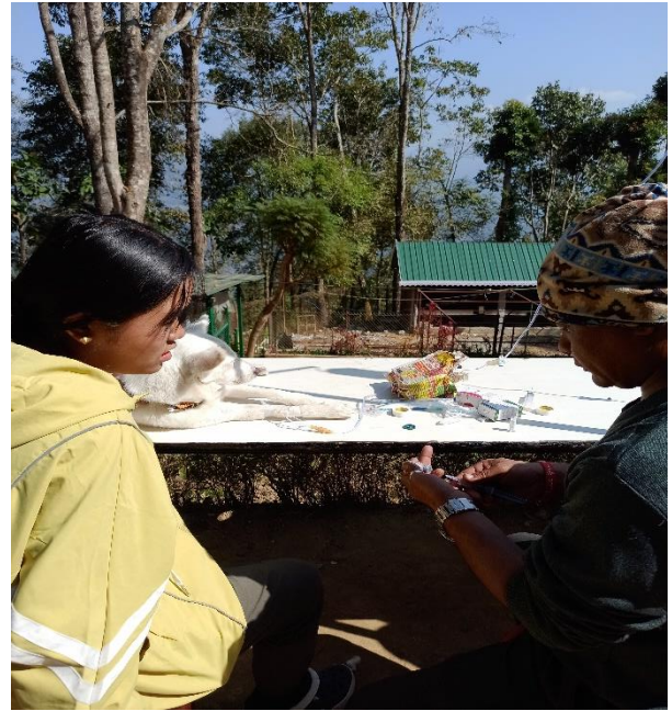
ANIMAL CLINIC AT KAS